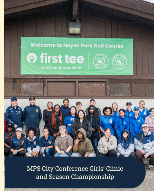
MPS City Conference Girls' Clinic and Season Championship