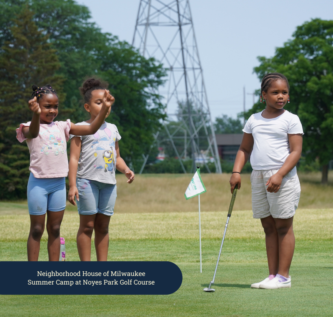
Neighborhood House of Milwaukee Summer Camp at Noyes Park Golf Course