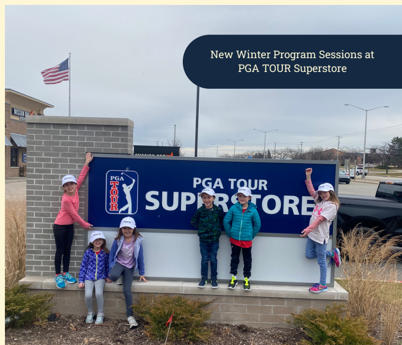
New Winter Program Sessions at PGA TOUR Superstore