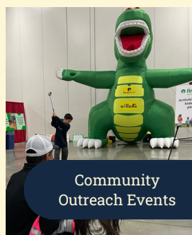
Community Outreach Events