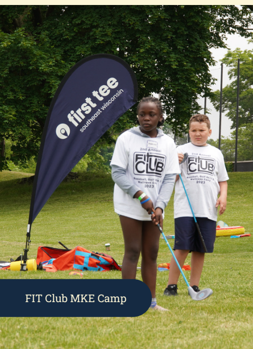
FIT Club MKE Camp