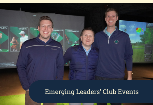
Emerging Leaders' Club Events