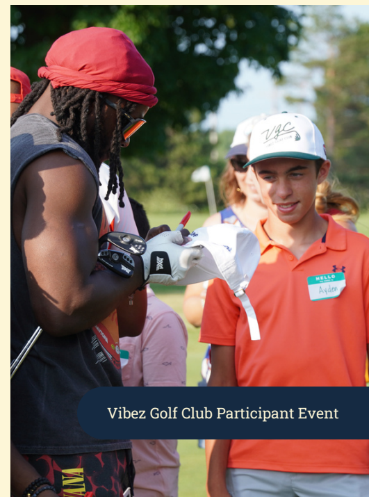
Vibez Golf Club Participant Event